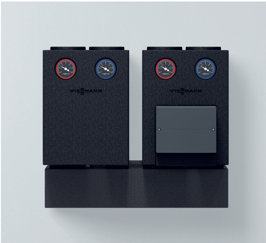
The new Divicon heating circuit distributor from Viessmann optimises the distribution of heating energy and ensures pleasant room cooling in summer by optimally supporting the cooling function of Vitocal heat pumps.

Today's heating systems are becoming increasingly complex. In addition to precise regulation of heat generation, the distribution of heating energy across individual heat transfer surfaces is also controlled to an exact degree. The aim is to operate as efficiently as possible while maximising convenience for the end customer. The Divicon heating circuit distributor plays a special role here.